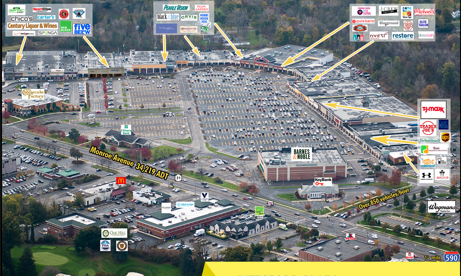
PITTSFORD PLAZA Pittsford, NY