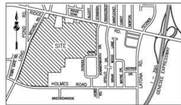
LOCATION SKETCH N.T.S.